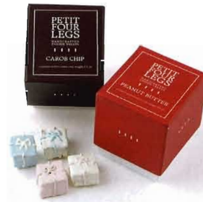
Treats that mimic human sweets, such as these tiny cakes from Petit Four Legs, offer a nutritious way to spoil pets.

more of the fawning over the dog, and more human-dog bonding at the point of giving that treat. There's more thought in giving it as opposed to a normal treat that looks like a dog bone."