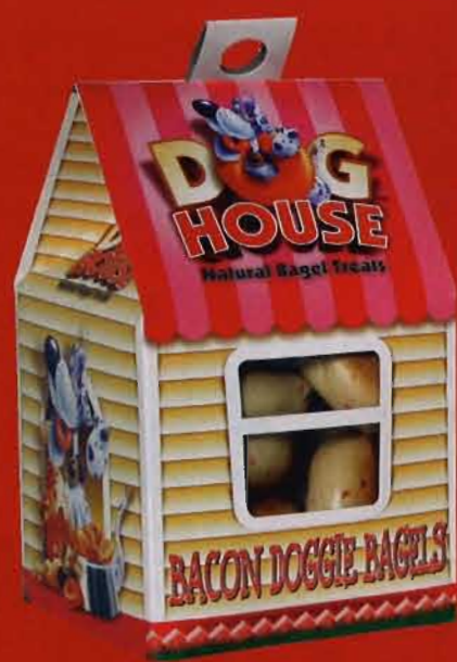
Inventive packaging helps bagel-shaped treats from Bagel House L.L.C. stand out on store shelves.